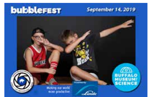
One of hundreds of Souvenir Photos created for Bubblefest.